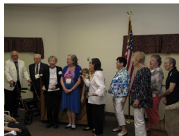
Guys N Gals Chorus